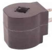
ASC2 – DIN

Requires ASC2 female connector (PCN 059261).